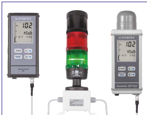
Dosimeter with remote control and external alarm unit

Remote control and external alarm unit can be attached to dosimeters for remote monitoring applications.