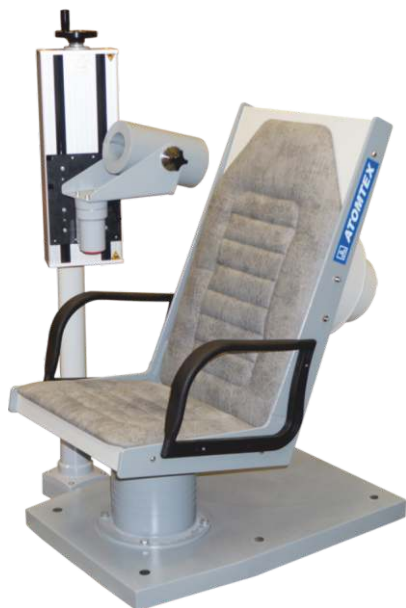
Joined version of AT1322 and AT1316/AT1316A

WBC operating principle is based on detection of gamma-radiation from 131 I and 133 I isotopes present in human thyroid gland by spectrometric detecting unit, and processing of instrument spectra on PC by dedicated software tools.